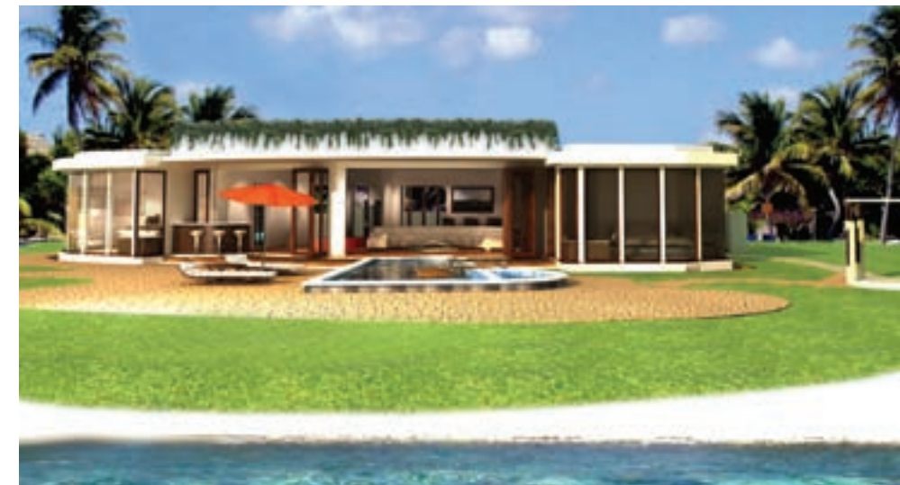
Each villa has a stunning sea view and is harmoniously surrounded by a lush, tropical environment.

For most of us, the beauty of Bali is etched in our minds by summer vacations to the island's sandy white beaches along the southern coastline. Others who have ventured a little further from the tourist-saturated spots would have found a vast landscape of volcanoes, padi fields and lakes in central Bali. The west side however – known for its mountainous terrains – is the least populated part of the island, and incidentally, an area that's freckled with gems waiting to be explored, like a fully preserved natural park and an unspoiled beach stretch fronting the Java Sea.