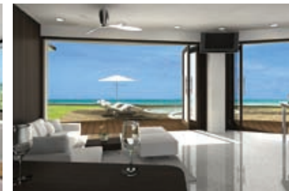
The luxurious interiors are designed by a team of professionals who fuse the magic of Bali and comforts of modern life into inspirational living.