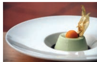
Top left, clockwise: Spicy Crabmeat Linguini with Chilli Tomato Cream & Seafood Crustacean Oil Spaghetti; Ribeye Steak with Pioppini Mushrooms; Strawberry Cheesecake; Infused Panna Cotta with Gula Melaka; Salmon Carpaccio with Wasabi Dressing & Ebiko